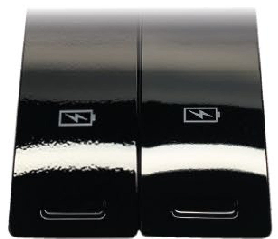
Orange Peel Effect with Paint In-Mold Method